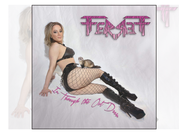
FERRETT IN THOUGH THE OUT DOOR MORIBUND ROCKERS! / MORIBUND RECORDS

Formed in 1985, Satan's Host's debut album, Metal from Hell , was originally released in 1986 and is a definitive chunk of classic 1980's metal – resting confidently alongside alongside Slayer's Show No Mercy , Mercyful Fate's Melissa , Venom's Black Metal and Bathory's Bathory ! Combining traditional heavy metal riffing with pre-power metal vocals, the high-energy of 1st wave thrash, and all the evil of Hell, Satan's Host set a standard with Metal from Hell that has rarely been surpassed! The most bootlegged album in metal history, this is Metal from Hell's first official release since its original run. Additionally, the album has been completely remastered from the original source master reels, ensuring the best sounding version ever of this mandatory piece of Heavy Metal History!