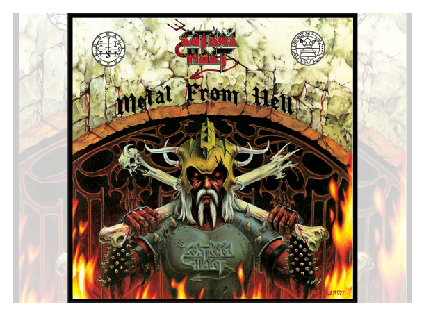
SATAN'S HOST METAL FROM HELL MORIBUND RECORDS

Formed in 1985, Satan's Host's debut album, Metal from Hell , was originally released in 1986 and is a definitive chunk of classic 1980's metal – resting confidently alongside alongside Slayer's Show No Mercy , Mercyful Fate's Melissa , Venom's Black Metal and Bathory's Bathory ! Combining traditional heavy metal riffing with pre-power metal vocals, the high-energy of 1st wave thrash, and all the evil of Hell, Satan's Host set a standard with Metal from Hell that has rarely been surpassed! The most bootlegged album in metal history, this is Metal from Hell's first official release since its original run. Additionally, the album has been completely remastered from the original source master reels, ensuring the best sounding version ever of this mandatory piece of Heavy Metal History!