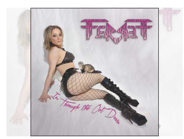
FERRETT IN THOUGH THE OUT DOOR MORIBUND ROCKERS! / MORIBUND RECORDS

Formed in 1985, Satan's Host's debut album, Metal from Hell , was originally released in 1986 and is a definitive chunk of classic 1980's metal – resting confidently alongside alongside Slayer's Show No Mercy , Mercyful Fate's Melissa , Venom's Black Metal and Bathory's Bathory ! Combining traditional heavy metal riffing with pre-power metal vocals, the high-energy of 1st wave thrash, and all the evil of Hell, Satan's Host set a standard with Metal from Hell that has rarely been surpassed! The most bootlegged album in metal history, this is Metal from Hell's first official release since its original run. Additionally, the album has been completely remastered from the original source master reels, ensuring the best sounding version ever of this mandatory piece of Heavy Metal History!