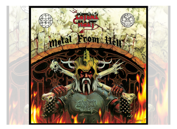
SATAN'S HOST METAL FROM HELL MORIBUND RECORDS

FerreTT's latest dives into the party realm of high energy, mammoth-fun, sex-fueled hard rock-n-roll!!! Not merely restricted to catchy Heavy Metal, FerreTT exudes prowess in songwriting through ballads comparable to the mega-hits of 80's Hairspray classics such as Poison's "Every Rose Has it's Thorn," Mötley Crüe's "Home Sweet Home" or Dokken's "Alone Again." But don't let all that Aqua Net scare ya: FerreTT delivers True Rock and Roll with the party edge of L.A.'s Decade of Decadence (AKA 1980's Sunset Strip era Hair Metal). Whether rocking hard with "Year of the Ferret" and "Jason Lives," or swooning the ladies with ballads like "On My Way" and "In Through the Out Door" FerreTT have delivered a trashy masterpiece.