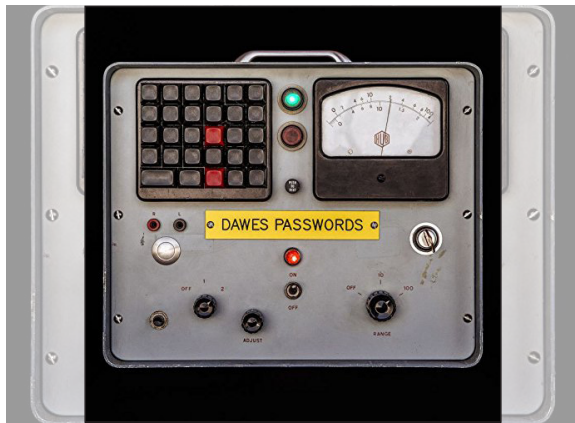
DAWES PASSWORDS HUB RECORDS