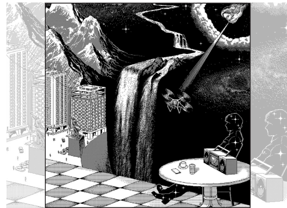
GRUFF RHYS BABELSBERG ROUGH TRADE