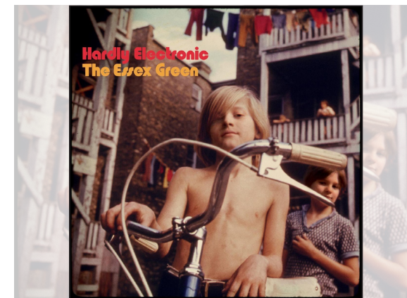
THE ESSEX GREEN HARDLY ELECTRONIC MERGE RECORDS