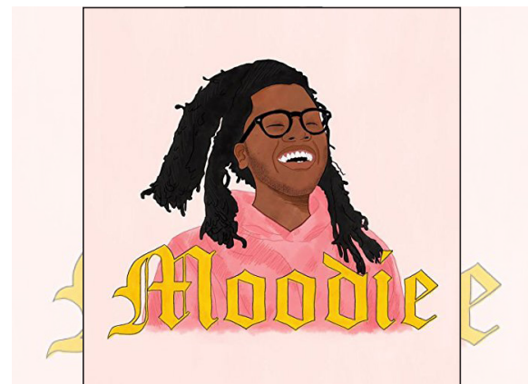
YUNO MOODIE SUB POP

It's rare that a band's debut album sounds as confident and self-assured as Rolling Blackouts Coastal Fever's Hope Downs . The promise of their perfect, buzz-building EPs - 2015's Talk Tight and last year's The French Press - has become fully realized here, with ten songs of urgent and passionate guitar pop that elicit warm memories of bands past, from the Go-Betweens' jangle to the charmingly lo-fi trappings of New Zealand's Flying Nun label and the pastoral jitters of New Jersey legends, The Feelies. But what sets RBCF apart from their peers is their lyrical ability which - bolstered by three singer / songwriter / guitarists - brings greater richness and humor to every track - each one a chiming novella. You need this.