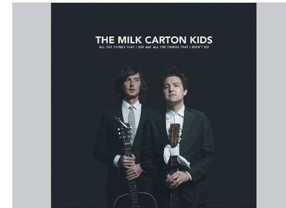
THE MILK CARTON KIDS ALL THE THINGS THAT I DID AND... ANTI

Lindsey Jordan is on the brink of something huge - and she's only just graduated high school. Her voice rises and falls with electricity throughout Lush , her debut album as Snail Mail . "Is there any better feeling than coming clean?" sings the 18-year-old guitarist and songwriter on the sprawling anthem, "Pristine." It's a question she seems to be grappling with throughout the record's 10-songs of crystalline guitar pop that conjures the awkward glory of Teen Beat records. Jordan's clear and powerful voice, immaculate pacing, and razor-sharp writing cut through the chaos and messiness of growing up. But Jordan's most masterful skill is in crafting tension: Working with muted melodrama that builds and never quite breaks. It's quite an introduction.