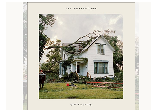
THE ROCK*A*TEENS SIXTH HOUSE MERGE RECORDS

Formed in Brooklyn in 1998 - and one of the few bands from the Northeast to be associated with the groundbreaking Elephant 6 Collective - The Essex Green released four albums between 1999 and 2006. The band broke its silence on the frigid waters of Lake Champlain during the blood moon eclipse of 2015. Over the next two years, the three continued to meet and record until Hardly Electronic became manifest. A musical mapping of the trio's personal journeys over the past decade, The Essex Green's signature sound is still alive and well: Stacks of harmonies, upbeat melodies, melancholy tales, layers of keys, and sparkling Telecasters. Fans of smart pop a la Belle and Sebastian will find much here to love.