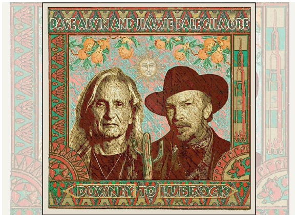
DAVE ALVIN AND JIMMIE DALE GILMORE DOWNEY TO LUBBOCK YEP ROC RECORDS