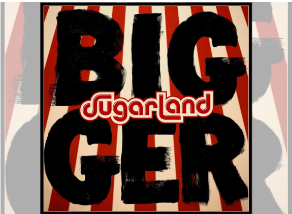
SUGARLAND BIGGER BIG MACHINE RECORDS

“It’s like we’ve been playing together since we were kids,” says Downey, CA’s Dave Alvin of his musical partnership with Lubbock, TX native Jimmie Dale Gilmore . Given their myriad shared influences and the undeniable chemistry the pair exhibits on Downey To Lubbock , it seems hard to believe they haven’t. Friends for over three decades, it took Alvin – the founder of seminal punk roots band The Blasters – and Gilmore , of the pioneering country-folk trio The Flatlanders, until 2017 to collaborate. Downey To Lubbock takes on a diverse range of American music spanning nearly one hundred years. Along with ten covers, Alvin wrote two originals for the record: the autobiographical title cut and the fantastical “Billy The Kid and Geronimo.”