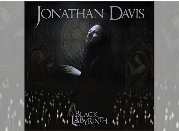
JONATHAN DAVIS BLACK LABYRINTH SUMERIAN

It would be nearly impossible to mistake anyone else for Jonathan Davis . A true original, the singer, songwriter, composer, producer, and multi-instrumentalist has indelibly impacts millions as the frontman for KoRn . However, 2018 sees him doing something new: Release his first solo album, Black Labyrinth . Writing and recording on the road, Jonathan played guitar, keys, and anything else he could get his hands on. Moreover, the music was primarily record live. Led by single “What It Is,” it continues a tradition by boldly treading new territory. “I’ve always got to be different,” he notes. “Once again, I’m doing something I haven’t heard before. This is my swan song. It’s my fucking masterpiece up to this point.”