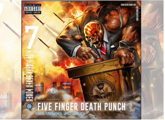
FIVE FINGER DEATH PUNCH AND JUSTICE FOR NONE PROSPECT PARK