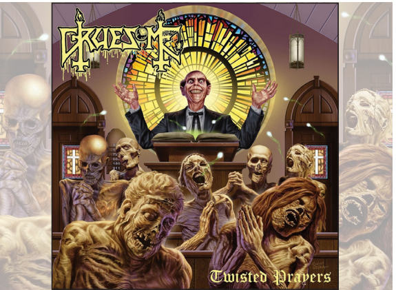
GRUESOME TWISTED PRAYERS RELAPSE