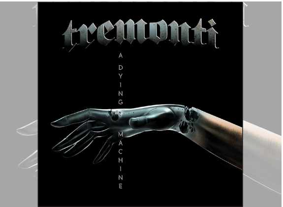
TREMONTI A DYING MACHINE NAPALM RECORDS