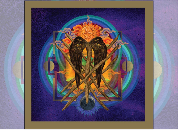
YOB OUR RAW HEART RELAPSE

Death metal defenders of the old Gruesome (featuring current and former members of Exhumed, Possessed, and Malevolent Creation) return with Twisted Prayers . It follows Death’s paradigm shift during the Spiritual Healing era, incorporating more cerebral, melodic instrumentation with elements of thrash and thought-provoking, socially conscious lyrics. Twisted Prayers features Gruesome doing what they do best across 40-plus minutes of unholy hymns with lurid melodies and vulgar atmospheres. The band has once again teamed up with the legendary Ed Repka (Death, Atheist, Massacre) for the album’s blasphemous, old-school cover art, while legendary Death guitarist James Murphy unleashes a pair of killer solos. Bow your heads and worship at the altar of Gruesome!