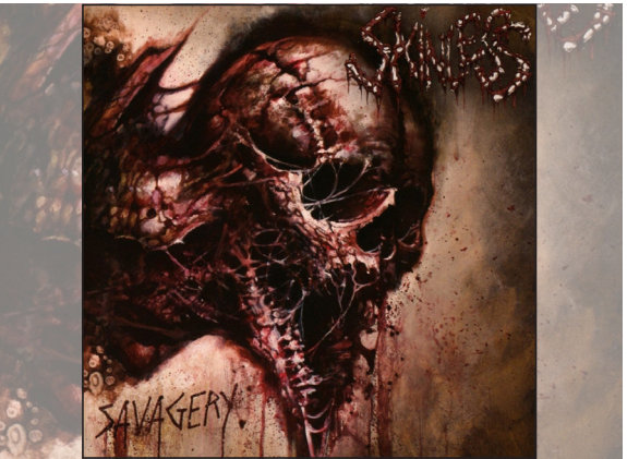
SKINLESS SAVAGERY RELAPSE