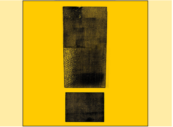
SHINEDOWN ATTENTION ATTENTION ATL