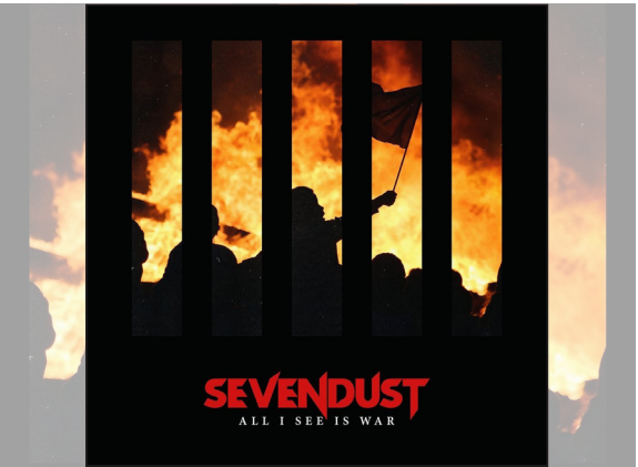
SEVENDUST ALL I SEE IS WAR RISE RECORDS

It would be nearly impossible to mistake anyone else for Jonathan Davis . A true original, the singer, songwriter, composer, producer, and multi-instrumentalist has indelibly impacts millions as the frontman for KoRn . However, 2018 sees him doing something new: Release his first solo album, Black Labyrinth . Writing and recording on the road, Jonathan played guitar, keys, and anything else he could get his hands on. Moreover, the music was primarily record live. Led by single “What It Is,” it continues a tradition by boldly treading new territory. “I’ve always got to be different,” he notes. “Once again, I’m doing something I haven’t heard before. This is my swan song. It’s my fucking masterpiece up to this point.”