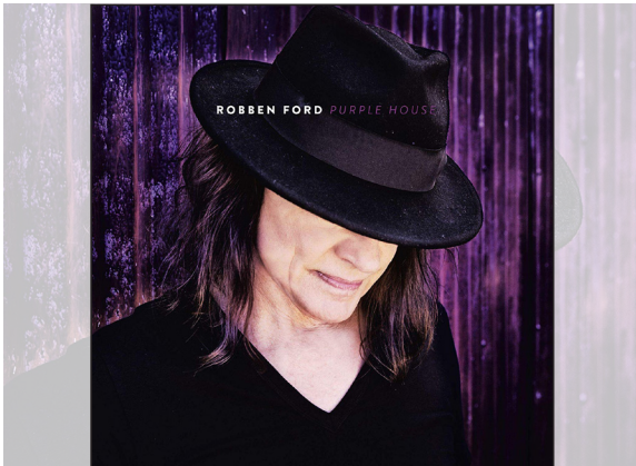
ROBBEN FORD PURPLE HOUSE EARMUSIC