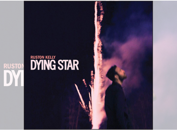
RUSTON KELLY DYING STAR ROUNDER

Ruston Kelly's highly anticipated full-length debut, Dying Star , was co-produced with Jarrad K (Kate Nash, Weezer) and recorded at Sonic Ranch in El Paso, TX. Of the album, Kelly comments, "A lot of my music is focused on suffering, or trying to understand the human condition through the lens of suffering...which probably sounds totally depressing, but it's actually the flipside of that. Sometimes you've gotta go into that darkness – you need to get lost and then figure out for yourself how to find your way back. That's the only way we can find pure joy, and really be thankful for the life we've been given." Kacey Musgraves and Joy Williams (The Civil Wars) are among the guests.