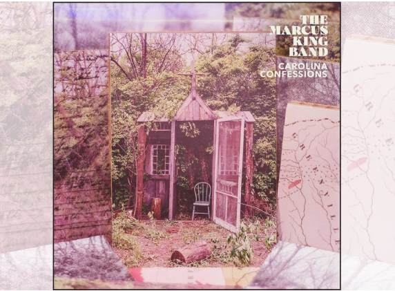
THE MARCUS KING BAND CAROLINA CONFESSIONS FANTASY

Ruston Kelly's highly anticipated full-length debut, Dying Star , was co-produced with Jarrad K (Kate Nash, Weezer) and recorded at Sonic Ranch in El Paso, TX. Of the album, Kelly comments, "A lot of my music is focused on suffering, or trying to understand the human condition through the lens of suffering...which probably sounds totally depressing, but it's actually the flipside of that. Sometimes you've gotta go into that darkness – you need to get lost and then figure out for yourself how to find your way back. That's the only way we can find pure joy, and really be thankful for the life we've been given." Kacey Musgraves and Joy Williams (The Civil Wars) are among the guests.