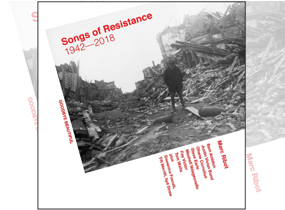
MARC RIBOT SONGS OF RESISTANCE 1942 - 2018 ANTI RECORDS