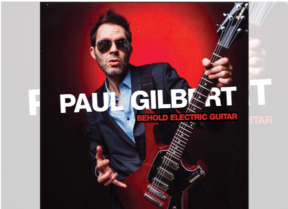
PAUL GILBERT BEHOLD ELECTRIC GUITAR MASCOT LABEL GROUP

Backyard barbeques, barroom brawls, tent revivals, and big rock festivals alike are suitable environments for the red dirt metal of the Texas Hippie Coalition , a band with a sound so devilishly electrifying that they had to come up with a new genre to describe it. High in the Saddle is a record of full-throttle ass kickers -- starting with the alarmingly catchy slither of "Moonshine". It oozes everything Texas Hippie Coalition stands for and smells like. A true Texas Hippie Coalition manifesto, if ever there was one: swampy grooves, Crüe-type partying, and a "Man In Black"-style saga. "Many men throughout time have referred to their woman as their sweet sunshine. Me being a creature of darkness... I refer to her as my moonshine..."