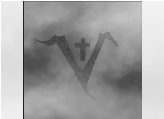
SAINT VITUS SAINT VITUS SEASON OF MIST