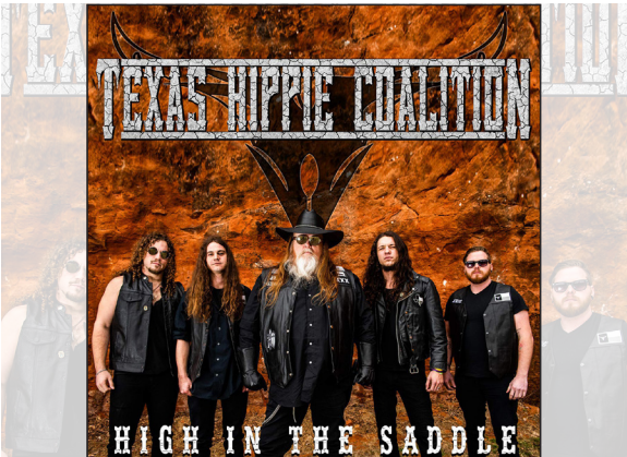
TEXAS HIPPIE COALITION HIGH IN THE SADDLE EONE