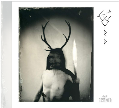
GAAHLS WYRD GASTIR - GHOSTS INVITED SEASON OF MIST

Sonic Brew 20th Anniversary Blend 5.99-5.19 is nothing like the infamously awful, failed experiment of New Coke. This is the original formula, like Coke Classic, but spiked with Viagra, the Captain America super soldier serum, and triple the caffeine. It's less of a floor to ceiling remodel than it is a fresh coat of paint, in preparation for another crazy house party. Zakk Wylde and crew were careful not to mess with the magic captured on the long lost two-inch tape. "The performances and everything is a snapshot in time. We just added on top of what was already there. It's like we went in and did surgery on this thing. We took the original CD master and added things that made it stronger."