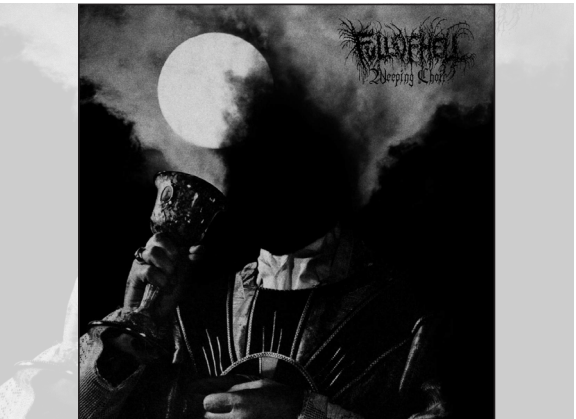
FULL OF HELL WEEPING CHOIR RELAPSE

GastiR - Ghosts Invited is the highly anticipated debut album from Gaahls WYRD . Fronted by legendary black metal vocalist, frontman, artist and composer Gaahl - j one of Norway's most talked about and respected extreme metal musicians - his work with Trelldom, Gorgoroth, Wardruna and God Seed has been widely regarded as some of the best the black metal scene has had to offer. Those who are expecting a blasting black metal offering are in for something unexpected. Even though GastiR - Ghosts Invited is firmly rooted in extreme metal, Gaahl's vocal delivery on this record is something out of the ordinary and the first class riffing in combination with the excellent musicianship is bound to take you places you've never been.