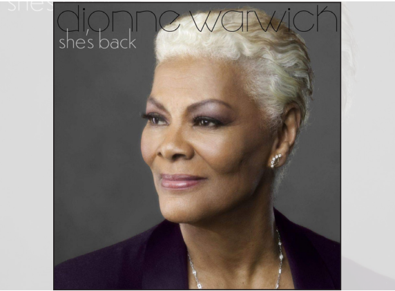
DIONNE WARWICK SHE’S BACK EONE