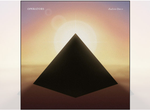
OPERATORS RADIANT DAWN LAST GANG