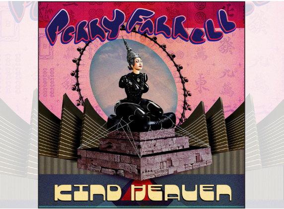
PERRY FERREL KIND HEAVEN BMG

Kind Heaven is Jane’s Addiction frontman / Lollapalooza mogul Perry Farrell’s first album of new music in a decade. The first single “Pirate Punk Politician” is a searing indictment of the current state of our planet under a rising tide of autocratic regimes. Farrell describes “Pirate Punk Politician” as “a good old fashioned protest song.” Sonically, it’s both somewhat familiar despite traveling into some daring sonic territory – imagine the Zeppelin-y stomp of Peak-Jane’s but remixed and gone wild in stereo by some fucked up DJ. It’s rather arresting – and a perfect summation of the music he’s been exploring throughout the 21 st century. If that wasn’t enough, there’s a Vegas residency to go with it. Once a ringmaster, always a ringmaster, one might suppose.