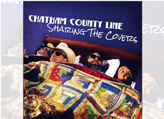
CHATHAM COUNTY LINE SHARING THE COVERS YEP ROC RECORDS