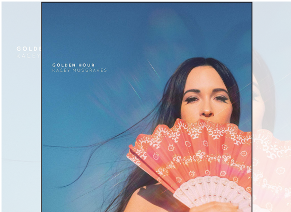
KACEY MUSGRAVES GOLDEN HOUR MCA NASHVILLE