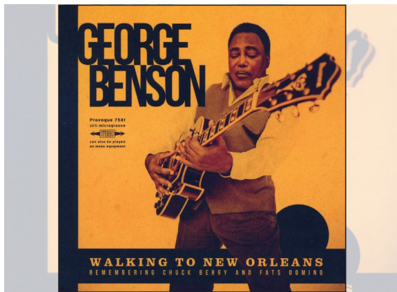
GEORGE BENSON WALKING TO NEW ORLEANS MASCOT LABEL GROUP