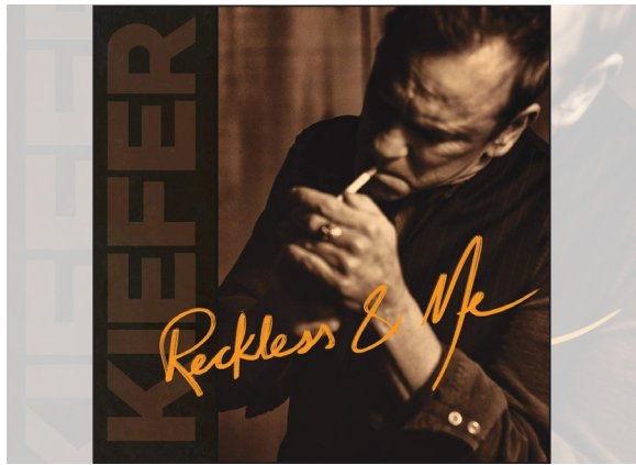
KIEFER SUTHERLAND RECKLESS & ME BMG