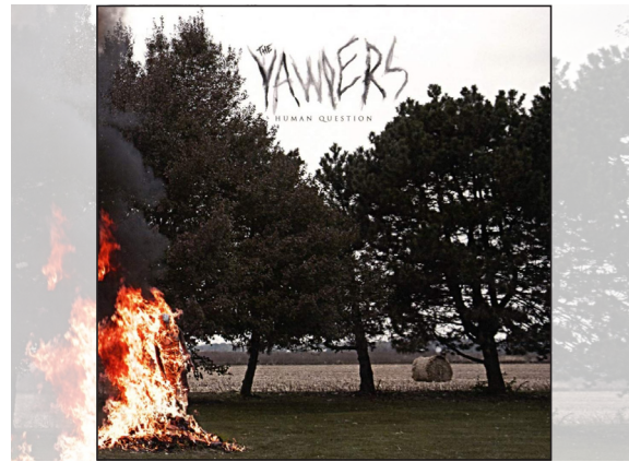
THE YAWPERS HUMAN QUESTION BLOODSHOT RECORDS

Walking to New Orleans is jazz guitar legend George Benson's tribute to both piano-pounding hit machine Fats Domino and the original rock guitar hero and poet, Chuck Berry. Walking to New Orleans is Benson's first recording since 2013's Inspiration: A Tribute to Nat King Cole . Where Benson embellished Cole's cool tunes with lush orchestral arrangements, the 10-track collection came about by hunkering down in a Music Row studio, with a quartet of first-call Nashville cats. The Chuck Berry songbook is represented by the good-timey "You Can't Catch Me," the sinuous "Havana Moon," the rollicking "Memphis, Tennessee," and the bluesy "How You've Changed." Fats Domino weighs in with the rollicking "I Hear You Knocking," "Blue Monday," and the album's iconic title track.