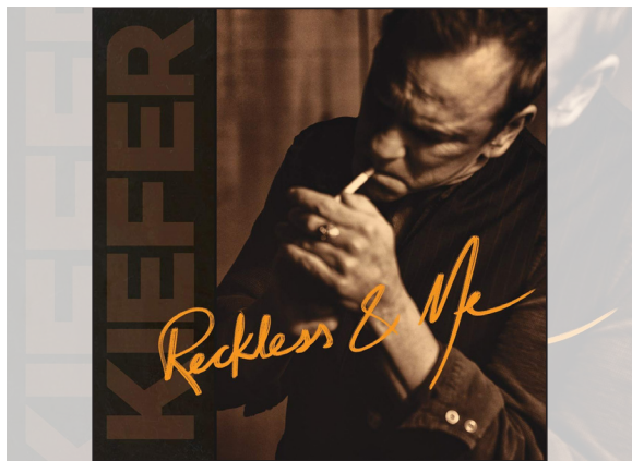
KIEFER SUTHERLAND RECKLESS & ME BMG