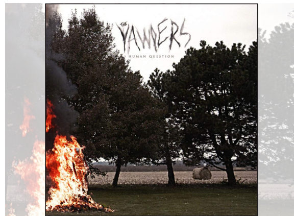
THE YAWPERS HUMAN QUESTION BLOODSHOT RECORDS

Walking to New Orleans is jazz guitar legend George Benson's tribute to both piano-pounding hit machine Fats Domino and the original rock guitar hero and poet, Chuck Berry. Walking to New Orleans is Benson's first recording since 2013's Inspiration: A Tribute to Nat King Cole . Where Benson embellished Cole's cool tunes with lush orchestral arrangements, the 10-track collection came about by hunkering down in a Music Row studio, with a quartet of first-call Nashville cats. The Chuck Berry songbook is represented by the good-timey "You Can't Catch Me," the sinuous "Havana Moon," the rollicking "Memphis, Tennessee," and the bluesy "How You've Changed." Fats Domino weighs in with the rollicking "I Hear You Knocking," "Blue Monday," and the album's iconic title track.