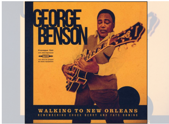
GEORGE BENSON WALKING TO NEW ORLEANS MASCOT LABEL GROUP