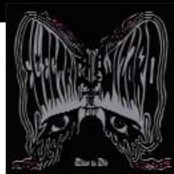
ELECTRIC WIZARD TIME TO DIE SPINEFARM RECORDS