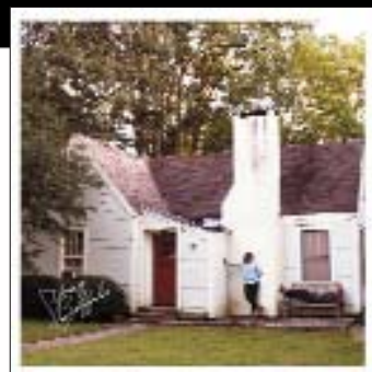
YOUNG BUFFALO HOUSE VOTIV MUSIC

"WE MUST BE ON OUR WAY, FINALLY OUT TO SEA, FLOATING ALL AWAY, FREE" VETIVER, "CURRENT CARRY"