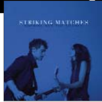
STRIKING MATCHES NOTHING BUT THE SILENCE I.R.S. NASHVILLE