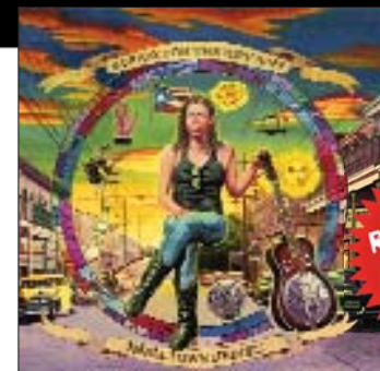
HURRAY FOR THE RIFF RAFF SMALL TOWN HEROES ATO RECORDS

Hurray for the Riff Raff is Alynda Lee Segarra — a Puerto Rican girl from the Bronx. After leaving home at an early age to travel the country, she eventually settled in New Orleans where she began to perform and record with a revolving cast of musicians. Many of the songs on her most recent album, Small Town Heroes , reflect Segarra's reverence for New Orleans. She bears witness to a wave of violence that struck the St. Roch neighborhood in the soulful "St. Roch Blues," yearns for a night at BJ's Bar in the Bywater in "Crash on the Highway," and sings of her home in the Lower Ninth Ward on "End of the Line," calling it a "love song to that whole area and crew of people." Small Town Heroes was heralded by many as one of 2014's best albums. One listen and you'll immediately know why.