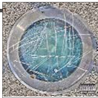
DEATH GRIPS THE POWERS THAT B HARVEST

Didn't they break up? Enough already. Art project or not? Thankless bums or brilliant provocateurs? How does one know anymore? Great P.R. for sure. Imagine a band that actually stood for something. Perhaps they'll finally tour. Synthetics and Sincerity are both poses. The Powers That B — Outsider art or Inside Baseball? (sounds rad, though)