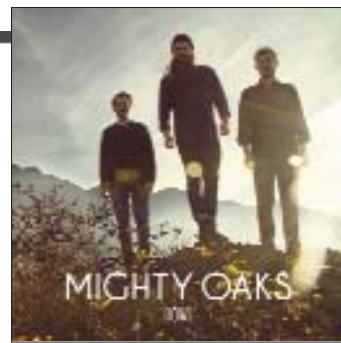
MIGHTY OAKS HOWL ASTRALWERKS

Didn't they break up? Enough already. Art project or not? Thankless bums or brilliant provocateurs? How does one know anymore? Great P.R. for sure. Imagine a band that actually stood for something. Perhaps they'll finally tour. Synthetics and Sincerity are both poses. The Powers That B — Outsider art or Inside Baseball? (sounds rad, though)