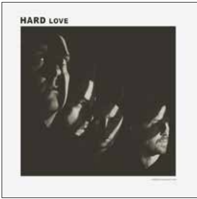
NEEDTOBREATHE HARD LOVE ATLANTIC

A music lover's dream – and a typesetter's nightmare – South Carolina rock band NEEDTOBREATHE has seen their fair share of ups and downs over the course of their career, but their latest chapter left them on a particularly high note unmatched by any of their previous work. Their blockbuster 2014 album Rivers In the Wasteland landed the band their first-ever Grammy Award nomination, topped Billboard's Top Rock Albums and Top Alternative Albums charts, and earned their highest-charting single yet with the RIAA Gold-Certified Top 10 hit "Brother (feat. Gavin DeGraw)." But when it came time to record its follow-up, the Charleston, South Carolina-based band decided to completely alter their creative approach and break into entirely new sonic terrain on their new album, HARD LOVE , to life by delving into the world of electronic effects and instrumentation. The result: a sublimely crafted and expansive sound that still reflects the larger-than-life intensity of NEEDTOBREATHE's unforgettable live show. A mix of soulful intensity, big hooks, and unbridled fuzz, tracks like "Money & Fame," "No Excuses," and "Happiness" recast NEEDTOBREATHE recalls The Band but with sheets of gnarly guitar. HARD LOVE is an easy sell. Crank it!