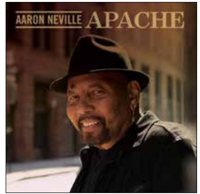
AARON NEVILLE APACHE TELL IT RECORDS