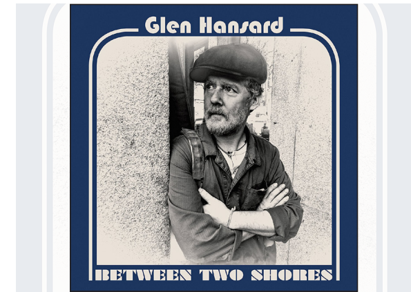
GLEN HANSARD BETWEEN TWO SHORES ANTI