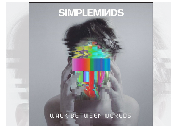
SIMPLE MINDS WALK BETWEEN WORLDS BMG